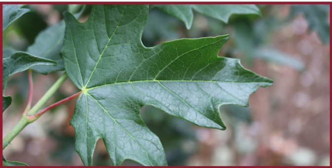
Green Mountain® Sugar Maple