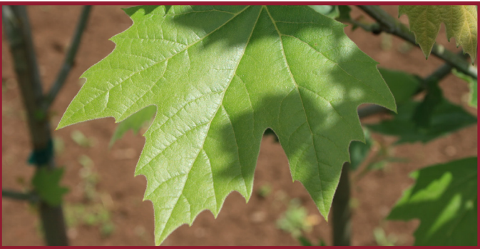
Exclamation™ London Planetree