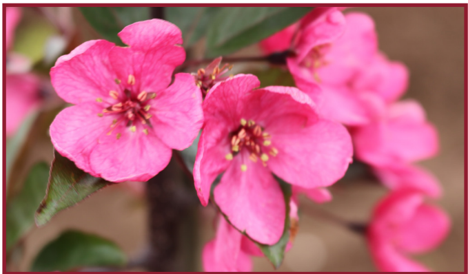
Show Time™ Crabapple