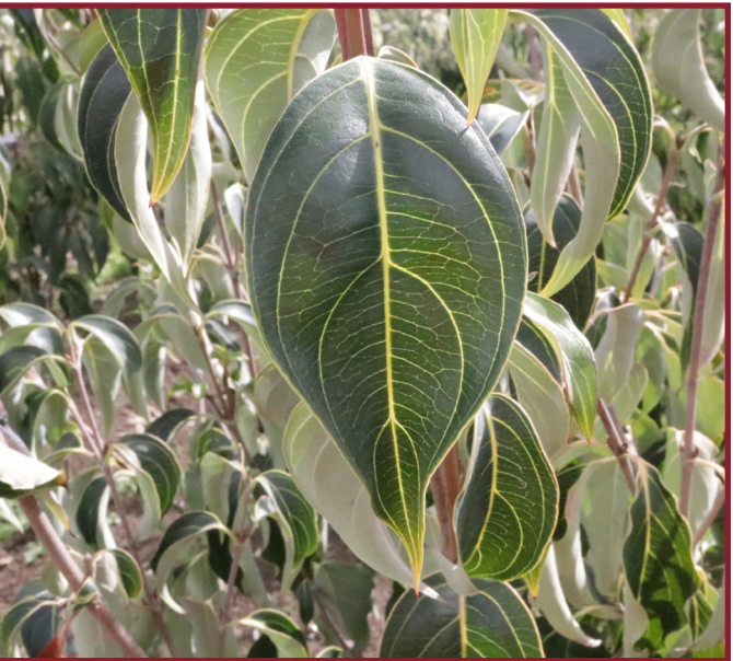
Snow Tower™ Columnar Dogwood