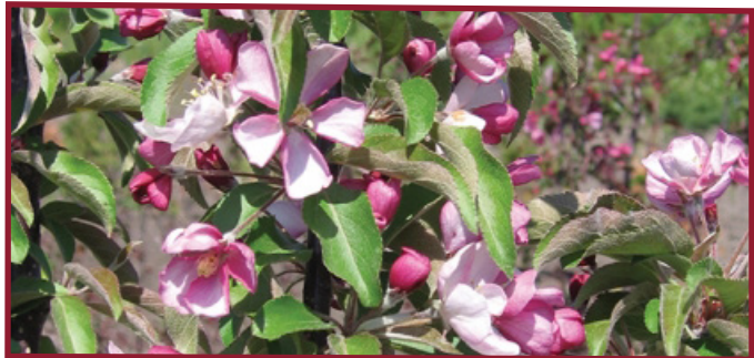
Emerald Spire® Flowering Crabapple