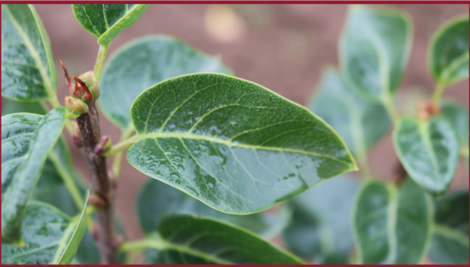
Yankee Doodle Lilac