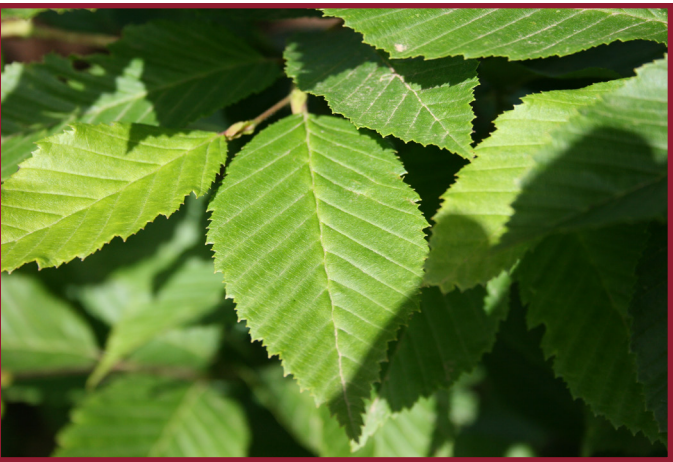
Pyramidal European Hornbeam

Celtis occidentalis Distinct light gray, rough corky bark. Elm-like foliage turns from light green to yellow in fall. Very hardy.