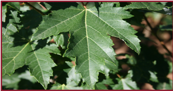
Sun Valley Red Maple