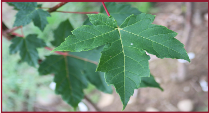
Redpointe® Red Maple