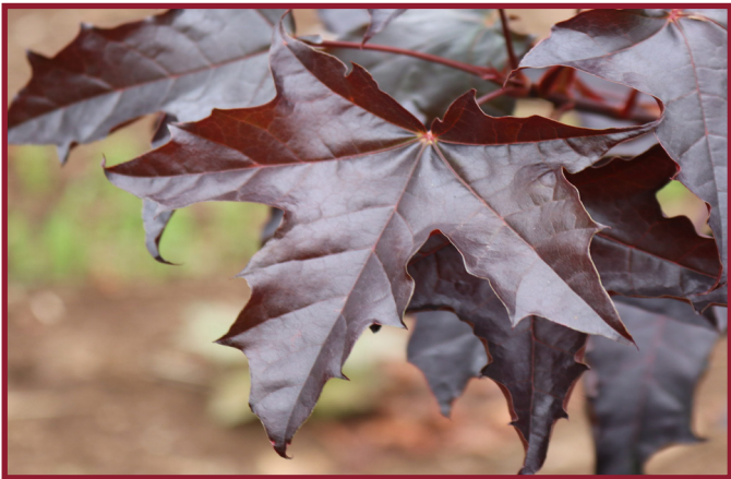
Crimson King Norway