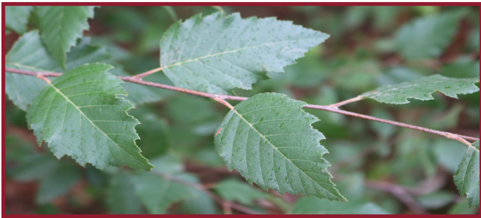
Dura-heat® River Birch

Betula nigra 'BNMTF' Dense canopy of dark green glossy leaves turn butter yellow in autumn. Creamy-white bark exfoliates at an early age. Small, thick lustrous leaves tolerate summer heat stress and resist leaf spot and aphids. Grown on their own root. Plus $.30 Royalty.