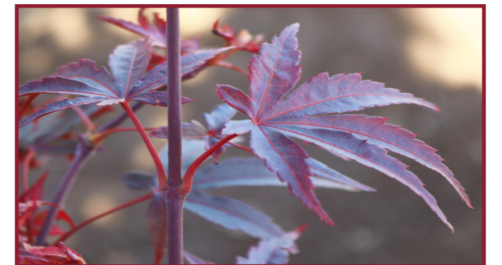
Emperor One Japanese Maple