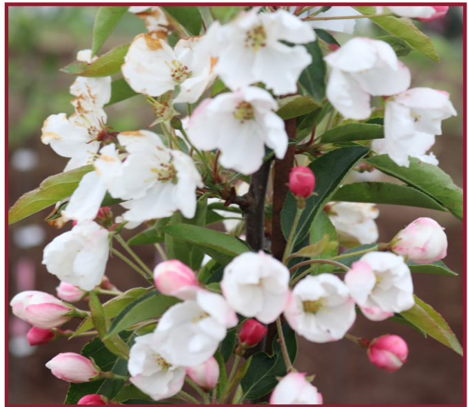
Red Jewel® Flowering Crabapple