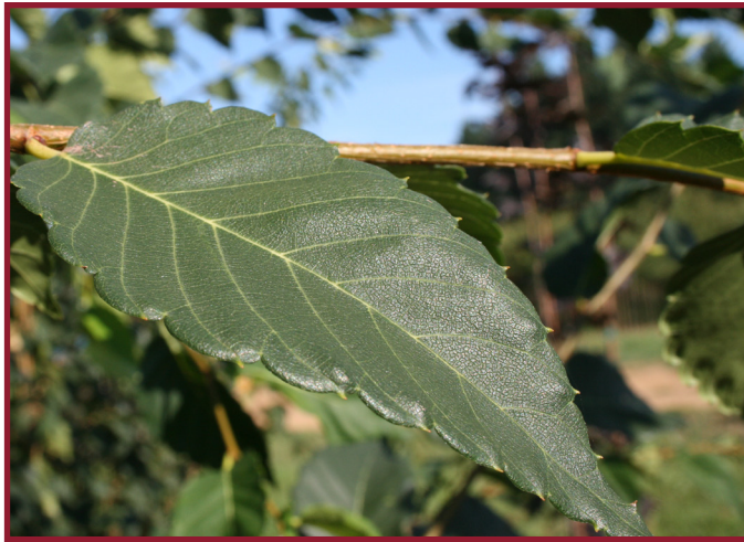
Village Green Zelkova