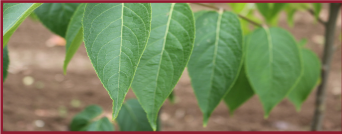
Hardy Rubber Tree