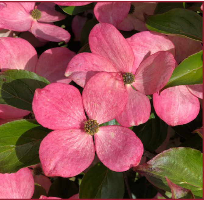
Heart Throb® Dogwood