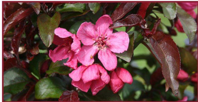
Prairie Fire Flowering Crabapple