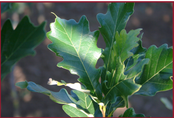
Regal Prince® Hybrid Oak