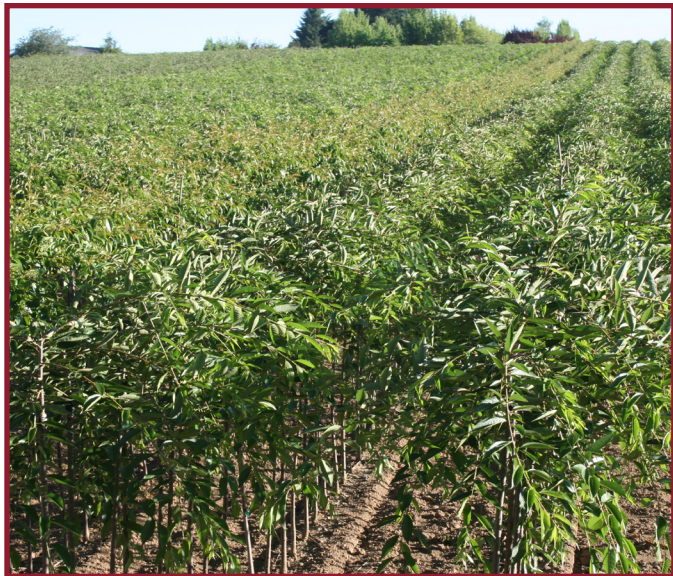
Double Subhirtella Weeping Cherry