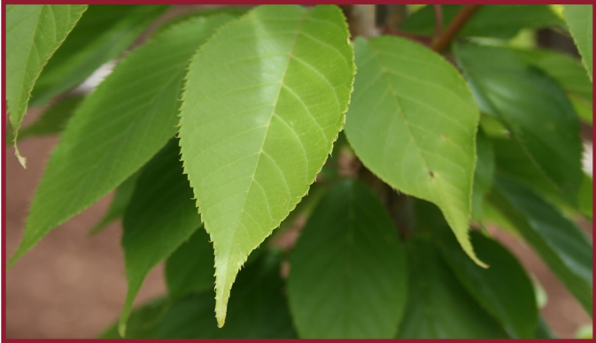
Kwanzan Flowering Cherry