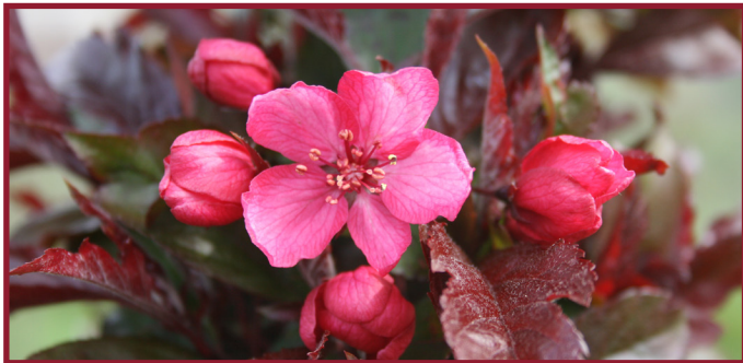
Royal Raindrops Flowering Crabapple