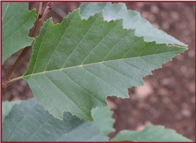
Fox Valley® River Birch

Betula nigra 'Cully' Improved selection known for its salmon-white exfoliating bark and large, glossy dark green leaves. Excellent planted in groups. Resistant to bronze birch borer. Upright rounded habit. Grown on their own root. Plus $.25 Royalty.