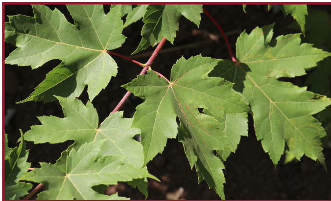
Autumn Blaze® Red Maple