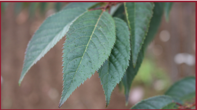
Okame Flowering Cherry