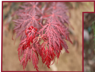
Tamukeyama Japanese Maple