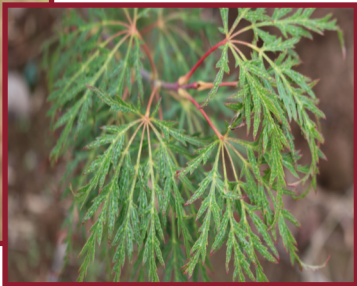
Viridis Japanese Maple