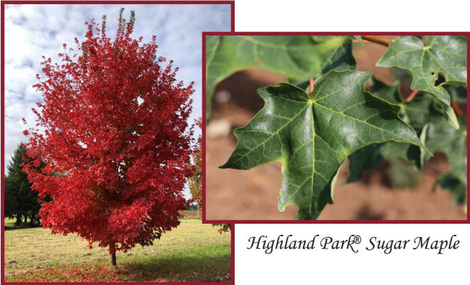
Highland Park® Sugar Maple