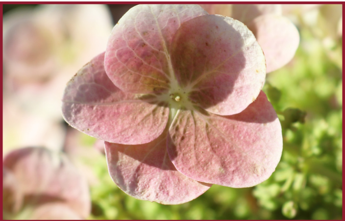
Ruby Slippers Hydrangea