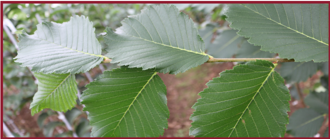
New Harmony Elm