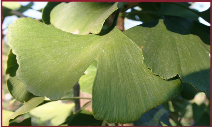
Autumn Gold Ginkgo