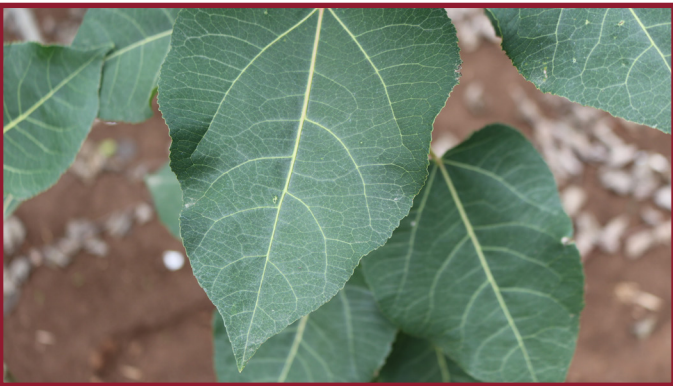
Dancing Flame Aspen