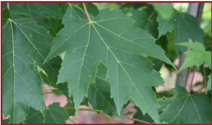
Armstrong Red Maple