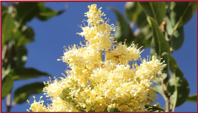
Beijing Gold™ Lilac