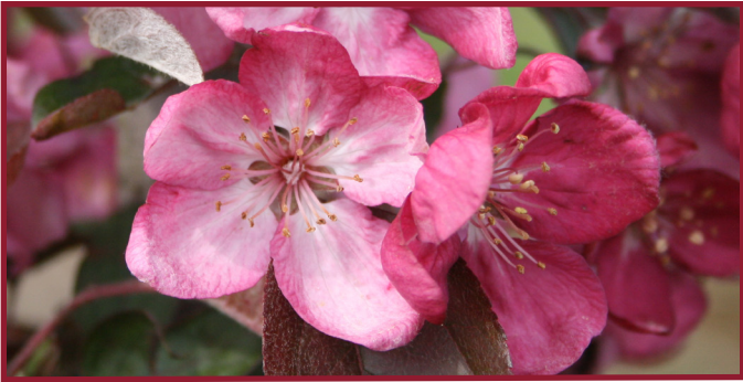
Robinson Flowering Crabapple