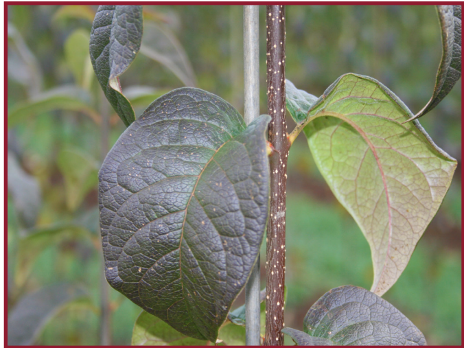
Ivory Silk® Lilac