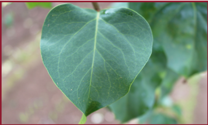
Summer Charm® Lilac