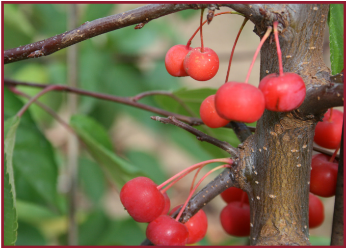
Sugar Tyme® Crabapple