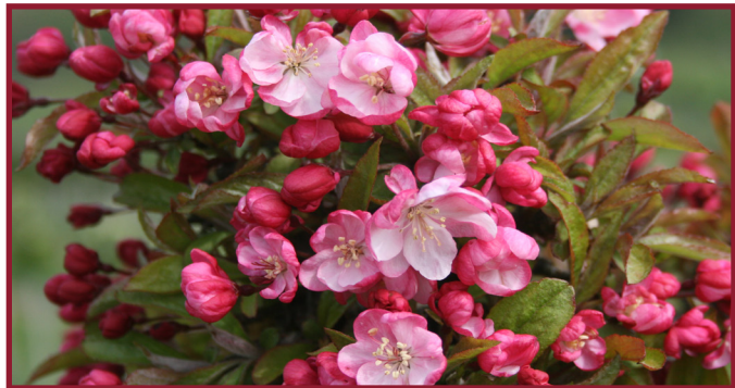
Coralburst® Flowering Crabapple