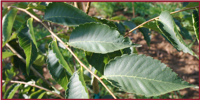
Green Vase® Zelkova