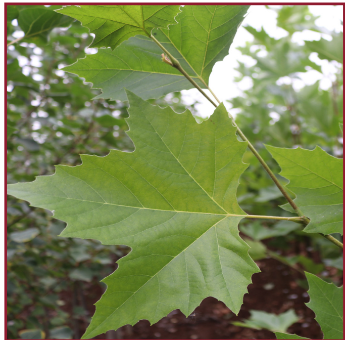
Bloodgood London Planetree