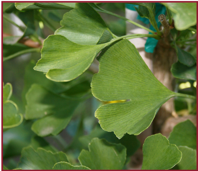
Presidential Gold Ginkgo